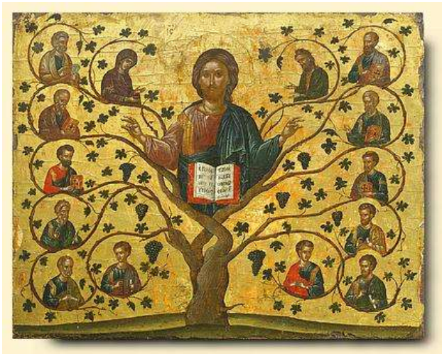
'Jesus the True Vine' Icon, Crete C 15th

Sunday 2 nd May 2021 Fifth Sunday of Easter