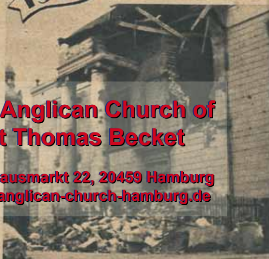
The church as it was when the Sappers took on the job of reconstruction.