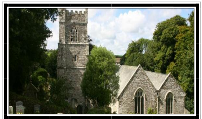
ST SYMPHORIAN CHURCH, VERYAN, CORNWALL