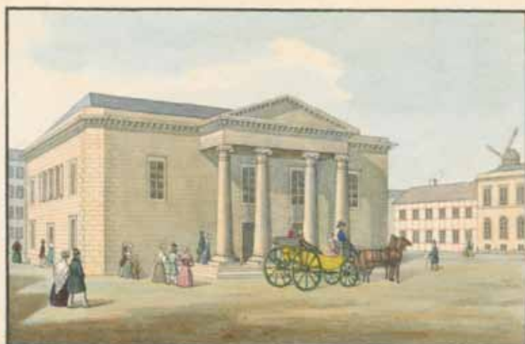
Die neue englische Kirche in Hamburg.

the successor to the chapel in the “English House”, Alte Gröningerstraße, where the Merchant Adventurers held church services in English for 200 years.